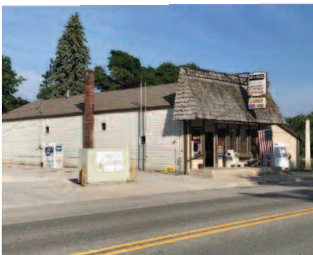
8869 W M-32 HIGHWAY • ELMIRA

Convenience/Party Store, Deli, Pizza, Groceries, Residential Rental. This is a 4 bedroom, 1 bath home that can be lived in while you run the store or could be rented as another source of income. Rent one run the other or rent both so many possibilities!! MLS #460589. $179,900