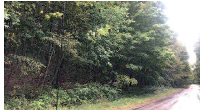
1709 MORRIS ROAD • EAST JORDAN

Heavily wooded property close to state land and snow mobile trails. There is a structure for storing your toys. Great little place to come to get away from it all. MLS #460769. $10,000