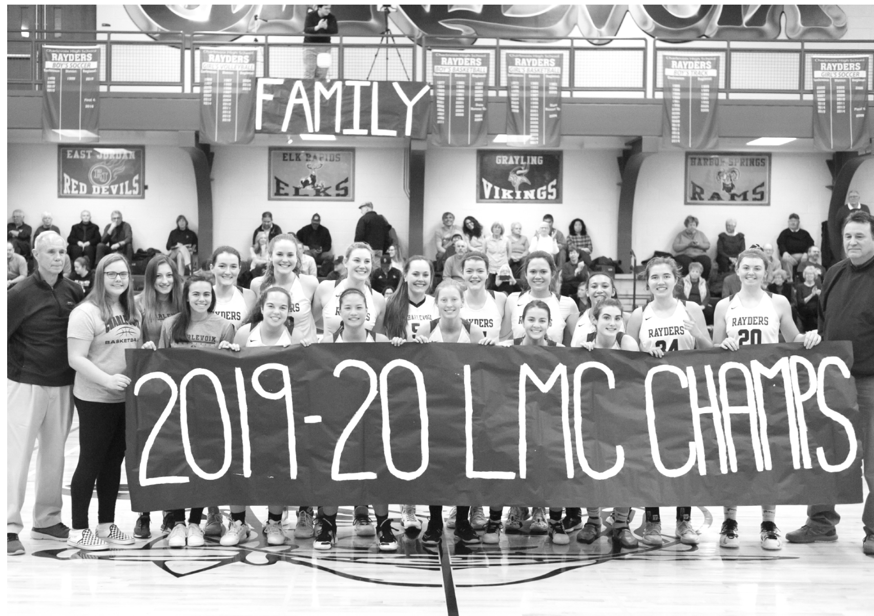
The 2019-20 Rayders proudly display a banner representing their Lake Michigan Conference championship. Charlevoix went undefeated in league play this season, earning their second straight league title.

Lately, that is what has been happening for the Charlevoix girls basketball team, as multiple players have stepped to the forefront