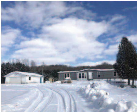
5902 MILES ROAD • EAST JORDAN

Find us at our new location... 109 Mill St., in East Jordan!