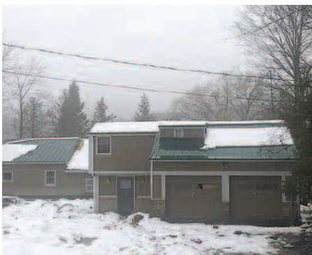
PRICE REDUCED! 05541 MILES ROAD • EAST JORDAN

Location, Location, Location!! These lots are located right across from Boyne Mountain... Great location to build your dream home! This location is close to all that Boyne Mountain has to offer... skiing, golfing, waterpark and great proximity to Lake Charlevoix too! MLS #457238, 457239, 457236, 457237 $25,000, $35,000, $33,000, $35,000